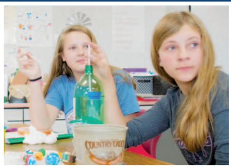
- Students in the School District of Wausaukee

QUOTES from middle school students whose teachers attended one of our trainings: