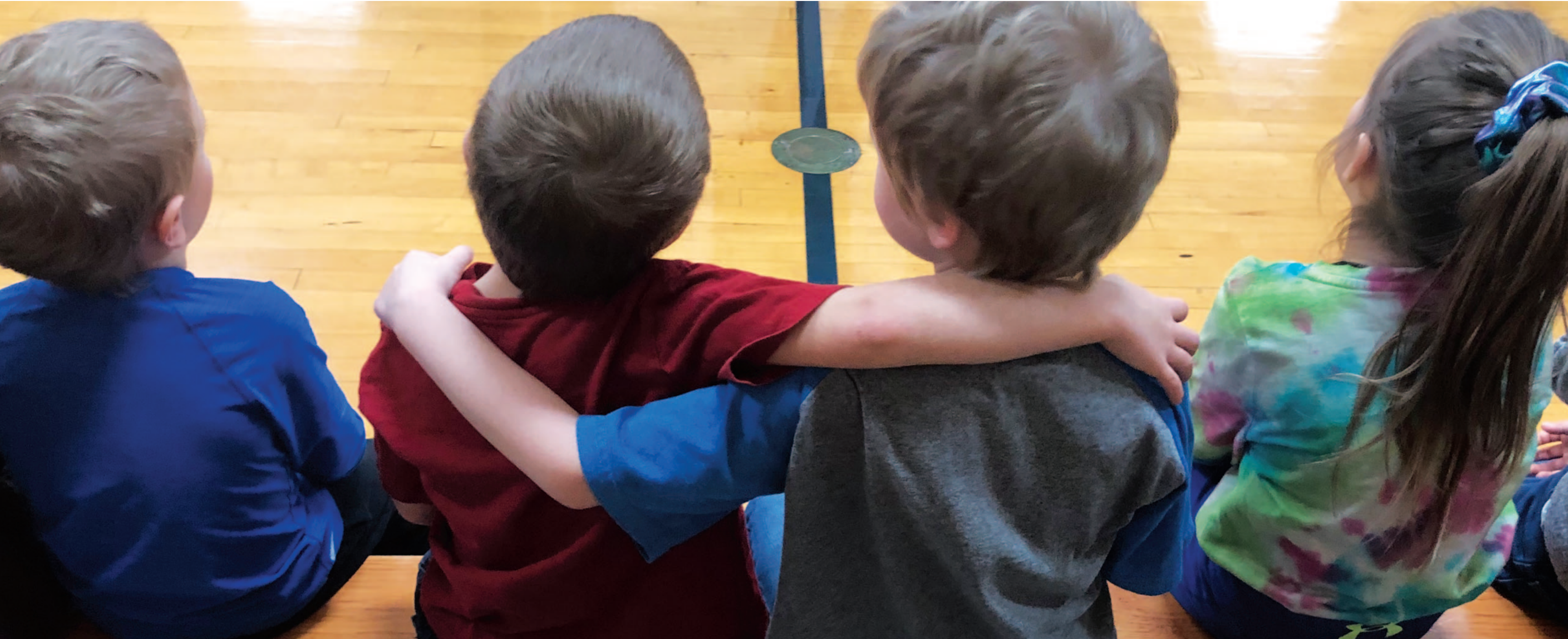
Beecher-Dunbar-Pembine School District students

the individuals who make up our Community, those who've built the Foundation on which we now stand. You are the ones whose involvement and engagement in good works is moving our communities forward.