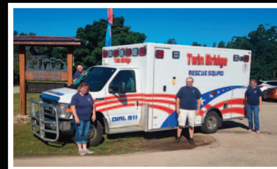
Twin Bridge Rescue Squad received a $7,000 Impact Fund grant.