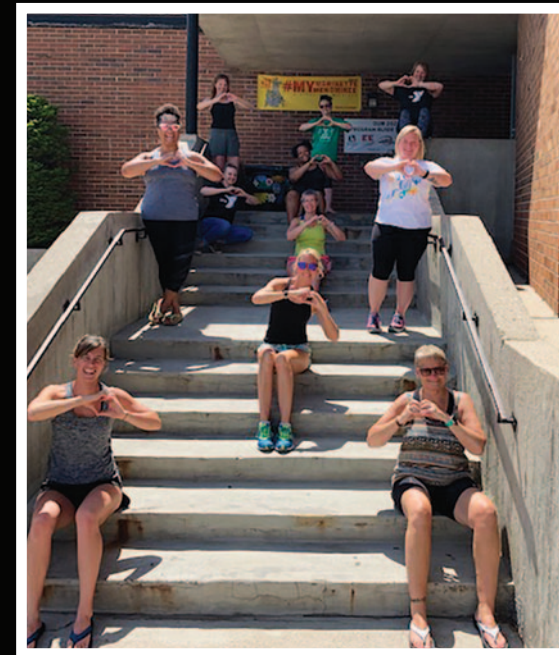
The Greater Marinette-Menominee YMCA received a $6,000 Impact Fund grant.

The MMACF created and seeded the Impact Fund for COVID-19 Relief with a $25,000 contribution and set about building that fund to over $60,000 with the help of donors throughout the area. The following organizations were awarded an Impact Fund grant: Abundant Life Mission, West Shore Fishing Museum, Camp Daniel, CASA of Brown County, Crivitz Rescue Squad, DAR Boys & Girls Club, Dorothy's Haven of Hope Homeless Shelter, Greater Marinette-Menominee YMCA, Marinette Youth Baseball, Menominee Animal Shelter, St. Joseph Conference of St. Vincent de Paul, Twin Bridge Rescue Squad, Wausaukee Enterprises, Wausaukee Rescue Squad, and St. Vincent de Paul Society of Marinette.