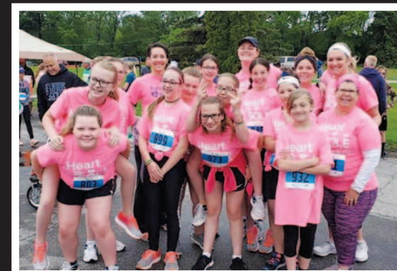
Menominee Area Public Schools - Heart & Sole Sisters Program Youth Field of Interest Endowment Fund Recipient

Our YAC was formed in 1996. Committee members are students, aged 12 - 21, from across Marinette and Menominee Counties. In addition to awarding grants, YAC'ers participate in community volunteer projects and have an opportunity to attend workshops with like-minded youth. Two YAC members are elected to the MMACF Board of Directors with full voting rights and responsibilities.